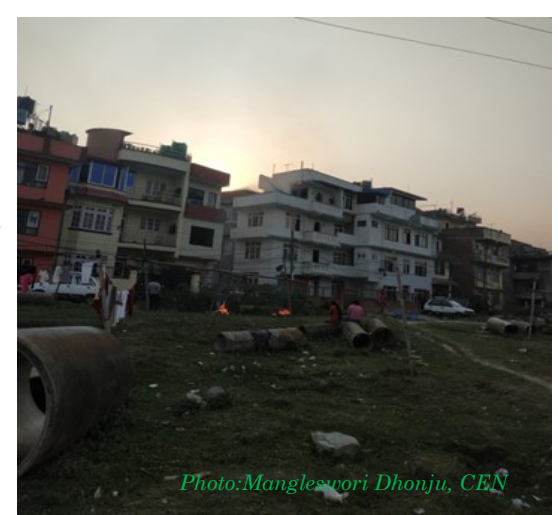
Garbage burning in Kathmandu

The WHO guidelines for PM2.5 is 25 \mu g/m<sup>3</sup> 24hour mean whereas the National Ambient Air Quality Standard set by the government is 40 \mu g/m3. During normal days, Kathmandu's air quality index fluctuates between 150 and 180 which is considered unhealthy.